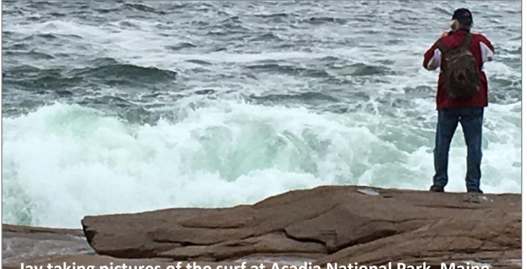
Jay taking pictures of the surf at Acadia National Park, Maine